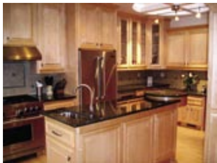
Creative Kitchens provides homeowners with a one-stop remodeling experience.