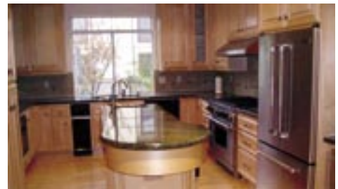
Creative Kitchens work covers floors, cabinets, appliances and countertops.

expansion, they know there is a safety program in place that will grow with them. Burrows says, “We have updated all our safety folders, and have them in every one of our vehicles and in our shops. Our hazardous materials folders are intact and we are comfortable that we are meeting all Cal/OSHA safety requirements.”